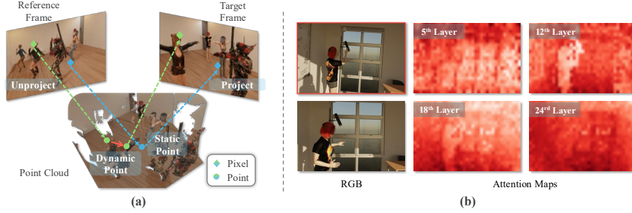
Figure 2: Motivating illustration: (a) In static scenes, geometric consistency is preserved across frames, while in dynamic scenes, moving objects violate this consistency. (b) Visualization of VGGT attention maps from the 5th, 12th, 18th, and 24th layers of global attention block with the method in Caron et al. (2021). Attention values are visualized using a white-to-red color map, with white indicating low values and red indicating high values. VGGT tends to ignore dynamic content during the feed-forward process, which motivates our design of the dynamics-aware mask.

To better understand this gap, we first follow Chefer et al. (2021) on feature visualization and examine key layers of VGGT (Fig. 2 (b)). We observe that dynamic regions exhibit weaker activations compared to static ones, suggesting that VGGT tends to ignore dynamic content. We then perform an ablation in which attention among dynamic tokens is explicitly suppressed (see Appendix). Masking dynamic patches from the cross-frame attention mechanism improves camera pose estimation, but at the same time leads to a sharp drop in geometry. Together, these findings reveal a fundamental tension in dynamic scenes: while camera pose estimation benefits from suppressing dynamic regions to maintain epipolar consistency, geometry requires exploiting their motion cues.