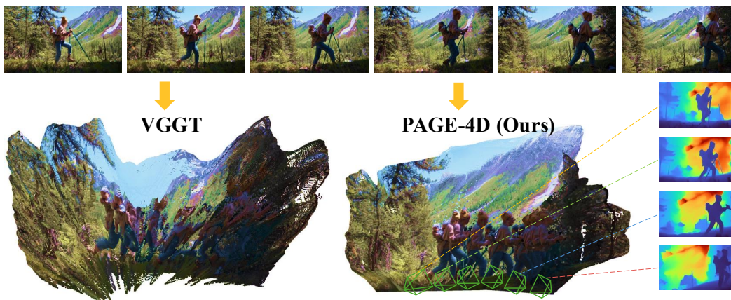
Figure 1: PAGE-4D takes a sequence of RGB images depicting a dynamic scene as input and simultaneously predicts the corresponding camera parameters and 3D geometry information—all within a fraction of a second. Compared to VGGT, PAGE-4D produces denser and more accurate point cloud reconstructions with better depth estimation quality. (Best viewed in PDF.)

5 Kempner Institute for the Study of Natural and Artificial Intelligence, Harvard University