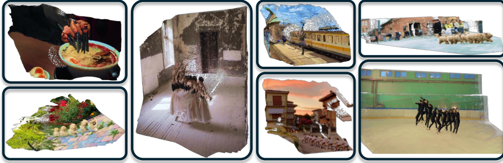
Figure 5: Qualitative Results of Point Cloud Estimation. PAGE-4D can estimate camera poses and depth maps from RGB inputs, even in the presence of dynamic objects. (Best viewed in PDF.)